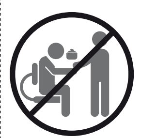
Don't apply ointment, cream, or any other product